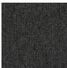
Contribute 97500 LRV 4