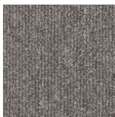
Progress 97515 LRV 18.5